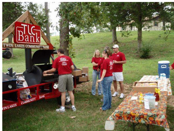
Grilling hot dogs at last years open house.

Once again, we will be inviting the entire community of North Central Arkansas to the Hatchery and to the Visitor's Center. We are proud of our hatchery and want to show it off. The Visitor's Center will be the focal point with games, instruction for both spin, bait and fly casting, fly tying demonstrations, hatchery tours as well as other activities still on the drawing board. Hot dogs and lemonade will be served for lunch.